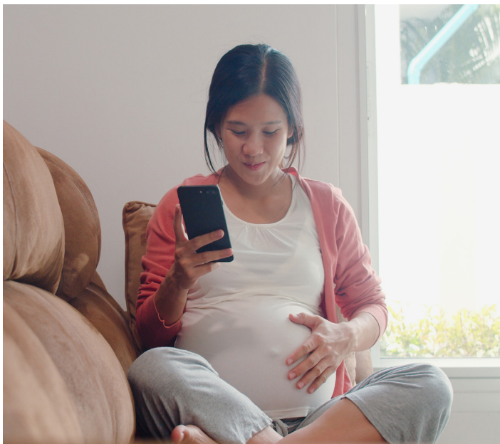
Bright by Text is for expecting parents too!

Bright by Text is available for expecting parents too! Sign up with your due date to receive pregnancy-related information timed to your expected delivery.