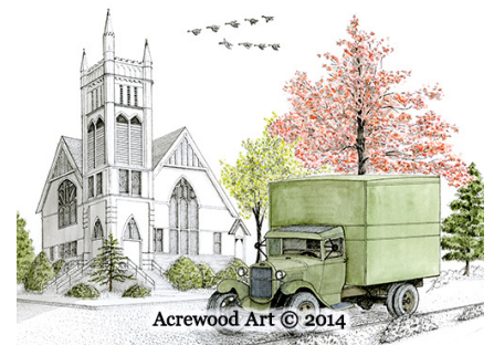
Acrewood Art © 2014